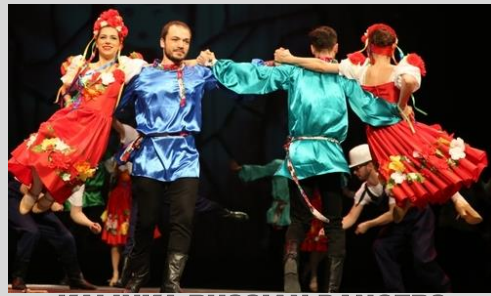
KALINKA RUSSIAN DANCERS