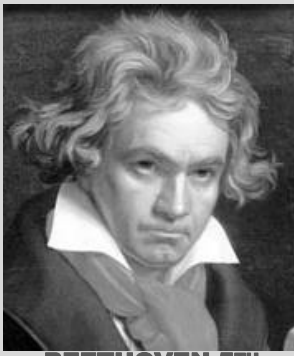
BEETHOVEN 5 TH SYMPHONY (Mvts. 1&4)