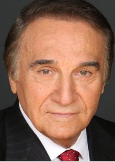
TONY LO BIANCO French Connection