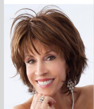
DEANA MARTIN BACK BY POPULAR DEMAND