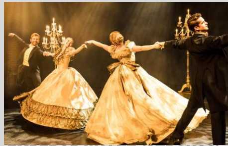
EMPEROR WALTZ (STRAUSS)