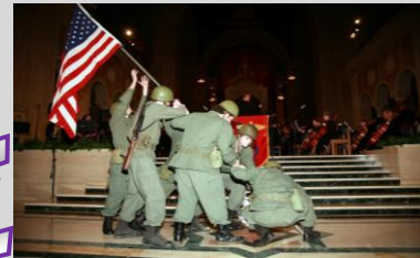
IWO JIMA REENACTMENT